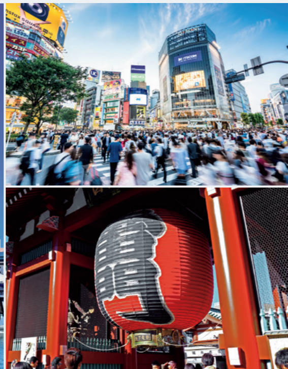
Enjoy the magic of the city of Tokyo along with the Tokyo 2020 Games. (Clockwise from top right) Shibuya Crossing, Kaminari-mon Gate in Asakusa, Sumida River and Tokyo Skytree.