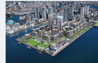
Active use of hydrogen energy for a sustainable Olympics and Paralympics. Above is a vision of the Olympic Village after the Tokyo 2020 Games.

selected for the second time to host the Olympic and Paralympic Games at the International Olympic Committee (IOC) Session in Buenos Aires, marking 56 years since Tokyo last hosted the Games. Since then, Tokyo has been making every effort to build momentum and make preparations for the greatest Games yet.