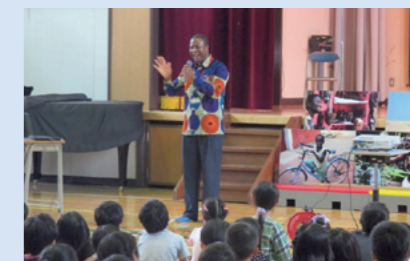
Children learning about the culture of Togo.

etc. of five designated countries and regions. By studying those particular countries, interacting with embassies, speaking to international students, and exchanging e-mails with local schools, students will have the opportunity to cultivate a profound sense of internationality. Children, too, are getting ready for the Games!