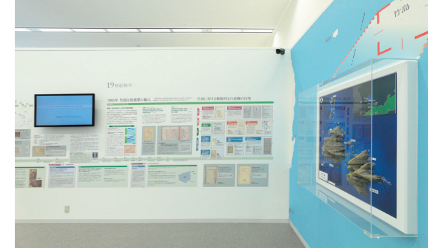
Display panels, a monitor showing video images, a diorama of the territory, and other exhibits comprise the Takeshima section. Evidence and documents substantiating the Japanese refutation are presented alongside the claims made by ROK.

the ROK side that is still proceeding. Takeshima is indisputably an inherent part of the territory of Japan, in light of historical facts and based on international law, but the illegal occupation by ROK continues. Japan will continue to seek the settlement of the dispute over territorial sovereignty over Takeshima on the basis of international law in a calm and peaceful manner.