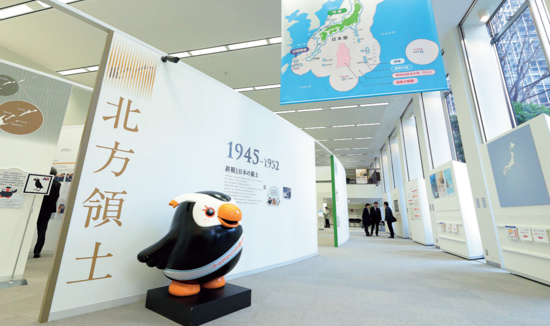
The museum is now open even on weekends and holidays (closed on Mondays). Visitors are welcomed by Erica-chan, the mascot for the Northern Territories. Admission is free. Located at 3-8-1 Kasumigaseki, Chiyoda-ku, Tokyo.

The section for the Northern Territories utilizes projection mapping, helping spectators visualize the process of the Soviet Union invasion and occupation of the Northern Territories. There are also displays showing the life of Japanese islanders before the war.