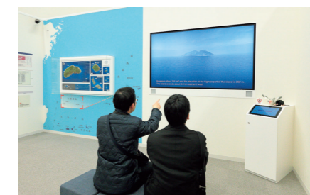
In the Senkaku section, the situation surrounding the Senkaku Islands is introduced using animated computer graphics from the perspective of the short-tailed albatross, a bird that lives on Minamikojima Island and Kitakojima Island.