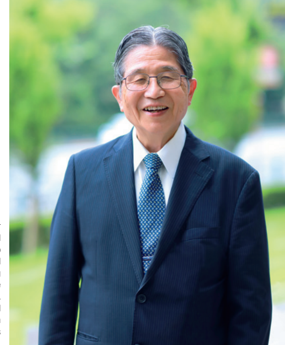
Dr. FUJISHIMA Akira is the director of the Photocatalysis International Research Center at the Tokyo University of Science. He discovered photocatalysis reaction using titanium oxide while enrolled at the University of Tokyo Graduate School. That discovery was later called the Honda-Fujishima effect, with research on artificial photosynthesis then being initiated around the world.

Dr. Fujishima currently heads the Photocatalysis International Research Center at the Tokyo University of Science, where he is leading research on further progress of photocatalysis in the fields of the environment and energy. “I think it's important for science to contribute to the world,” he says. Based on his discovery, a decarbonized society, where even CO 2 is used as a resource, will soon be realized. *