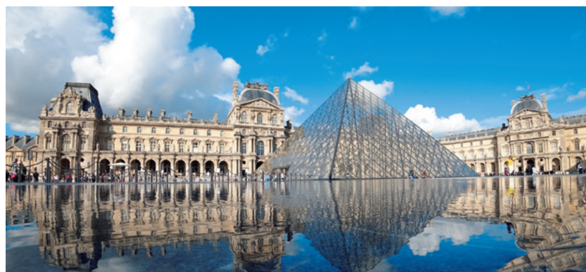
Photocatalysis acts as an antifouling and antifogging effect simply by the irradiation of light. It has also been used in the glass covering the pyramid-shaped entrance of the Louvre Museum. The glass maintains its transparent beauty by decomposing dirt.

Sustainable Development Goals (SDGs) aiming to reduce greenhouse gases, research on artificial photosynthesis has been increasingly gaining pace, though many challenges still remain. Dr. Fujishima says, “To achieve the practical applications of hydrogen production using artificial photosynthesis, the high efficiency of hydrogen extraction is, of course, the basic key factor. However, the other key factors are whether we can find a catalyst that satisfies the remaining various conditions; this includes whether the materials used as catalysts can be easily obtained, whether a large surface area photocatalyst can be manufactured, and whether any harmful substances are contained in the material. We are waiting for a breakthrough for those things in the future.”