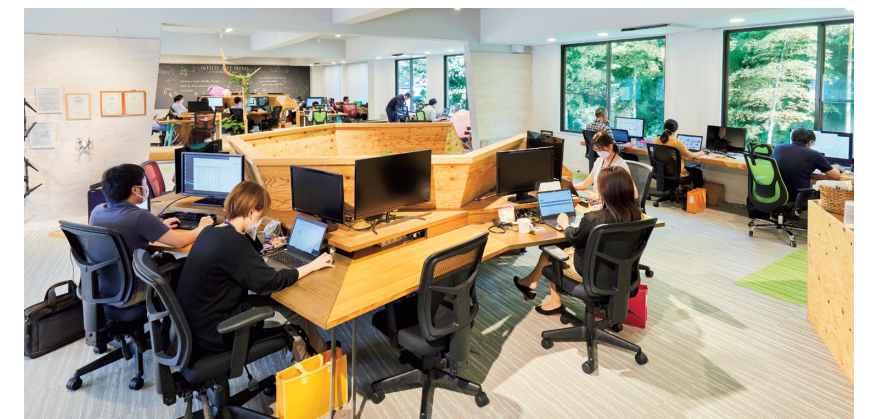
QualitySoft's office is surrounded by a grove of trees. Most of the interior areas, designed for a comfortable work environment, were built with locally-produced lumber.