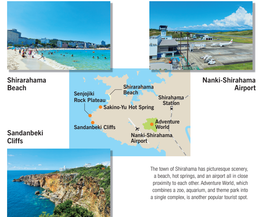
The town of Shirahama has picturesque scenery, a beach, hot springs, and an airport all in close proximity to each other. Adventure World, which combines a zoo, aquarium, and theme park into a single complex, is another popular tourist spot.

Companies' efforts in the town are thus rewarding employees with a better work-life balance while stimulating the local economy: a win-win situation. Even after the pandemic ends, there will still undoubtedly be more people—not just companies—moving location to explore a new working lifestyle. Shirahama, a resort town attracting an increasingly diverse range of people, is emitting bright rays of hope for a silver lining during these difficult times. ✿