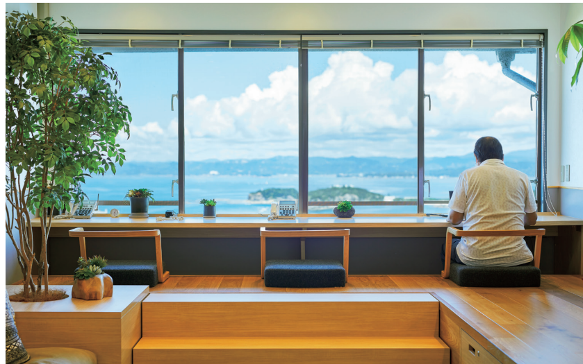
The panoramic view of the ocean as seen from NEC Solution Innovators' Shirahama Center. The open-plan space encourages greater communication within the workplace.

Shirahama, a town situated in the western Japanese prefecture of Wakayama, has long prospered as a resort destination owing to its warm climate, beautiful coast, hot springs, and picturesque scenery. Thanks to its convenient location—only an hour's flight from Tokyo—more and more companies have recently set up satellite offices in the town, revamping their traditional working styles by letting employees work while enjoying the amenities of the resort area. Earlier in 2020, as the pandemic made teleworking a reality for many workers and provided them with opportunities to work outside the office, Shirahama came to