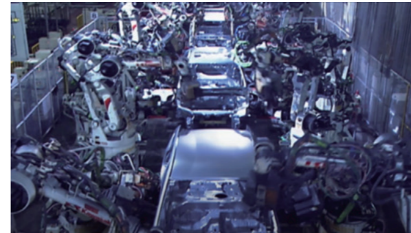
Close to the headquarters of Toyota Motor Corporation, Nagoya has become one of Japan's biggest industrial centers boasting both cutting-edge technology and a highly-skilled workforce.

various international meetings and events in the past, including COP10 in 2010 and UNESCO World Conference on Education for Sustainable Development in 2014. Treating the G20 ministerial meeting as a concerted regional undertaking, the local residents will unite to provide a heartfelt omotenashi hospitality to all the guests. Peace and friendship are essential to global development, and the people of Nagoya hope to make this opportunity an international gathering that will enable the world's leading nations to cooperate for the future of humanity. ✨