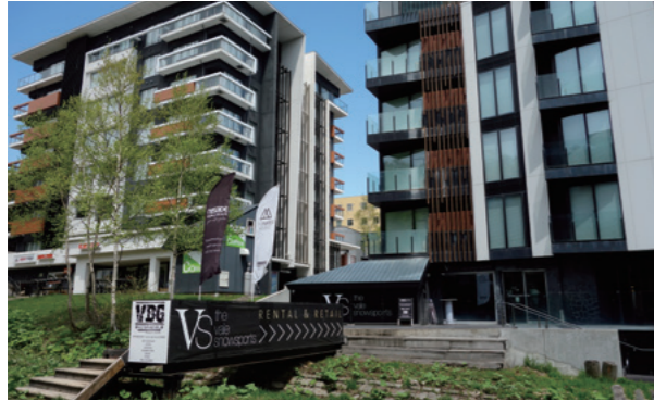
Kutchan supports the development of luxury condominiums and hotels, while enforcing strict town aesthetic standards.

Kutchan, Hokkaido Prefecture | Tourism Ministers' Meeting | October 25 to 26