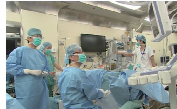
Okayama utilizes its abundant medical resources for community development, helping everyone to live a long and healthy life.

Through the Health Ministers' Meeting, in addition to showcasing Okayama's approach to health and medical care as an issue of critical importance, the message will be conveyed that medical care should be provided under the philosophy of universal health coverage, meaning that everyone should have access to affordable health care services in time of need. ✨