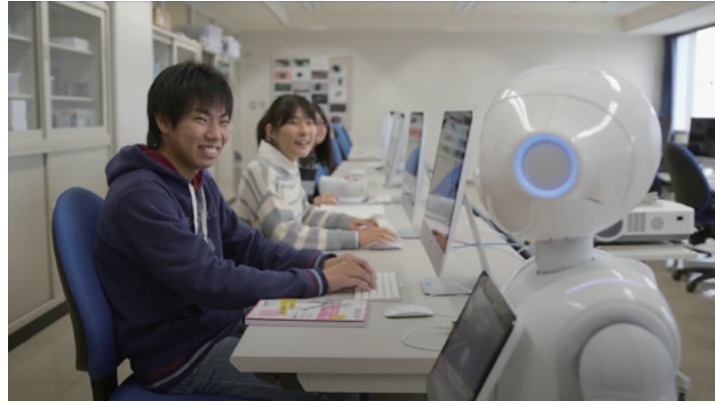
Ibaraki is devoted to the use of robotics and digital technology to foster a new generation of skilled professionals.

Tsukuba, Ibaraki Prefecture | Ministerial Meeting on Trade and Digital Economy | June 8 to 9