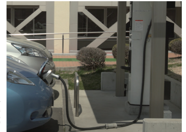
To preserve its uniquely beautiful nature, Karuizawa adopts such policies as subsidizing the purchase of electric vehicles.

town hopes that future generations will come to see the meeting as a big turning point regarding the world's environmental issues, and aims to create the best possible environment for productive discussions, while informing visitors about such efforts. *