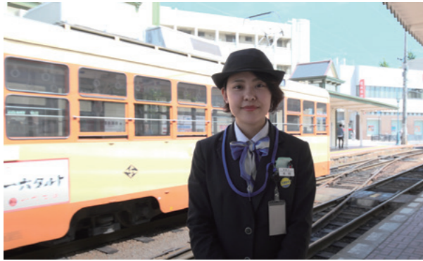
Matsuyama works hard to create a society that provides supportive work environments for everyone.

Matsuyama, Ehime Prefecture | Labour and Employment Ministers' Meeting | September 1 to 2