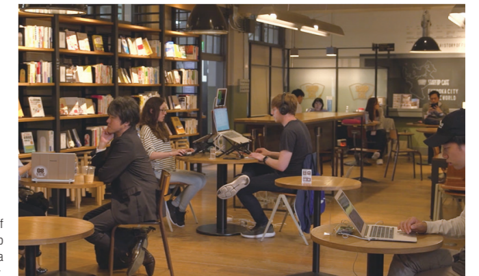
Fukuoka boasts one of Japan's largest startup accelerators, Fukuoka Growth Next.

The waves of innovation are surging in the financial sector as well, and the world is keeping a close watch on future developments, lending great significance to Fukuoka's hosting of the Finance Ministers and Central Bank Governors Meeting. As the host city, Fukuoka is determined to make the meeting a success. *