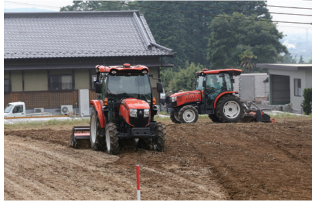
Niigata has implemented various advanced measures to boost its agricultural productivity, such as the use of driverless tractors.

Niigata, Niigata Prefecture | Agriculture Ministers' Meeting | May 11 to 12