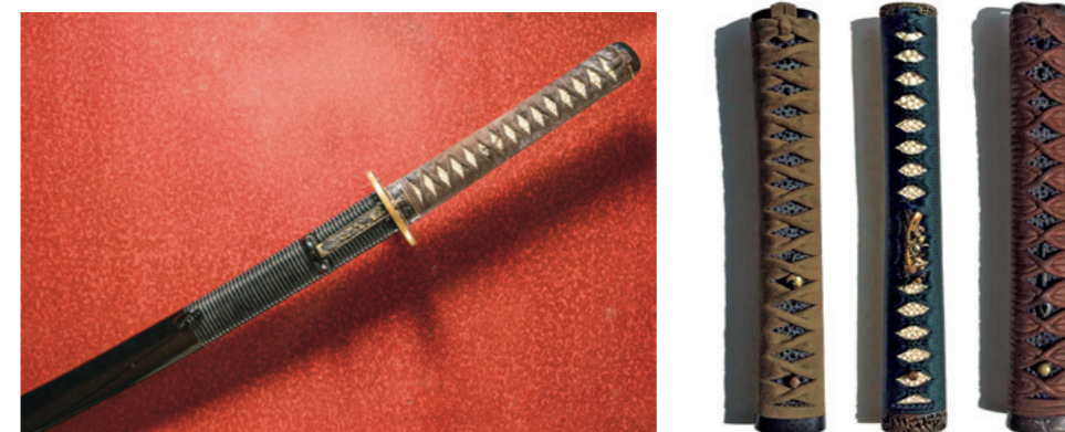
Japanese swords vary in style depending on the region. The Higo-koshirae is a style that marries function with beauty. It was established by a local lord who was also a master in sado (Tea Ceremony).