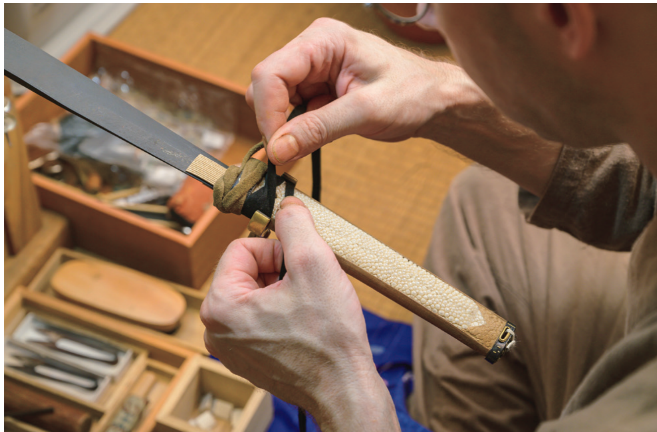
The process called tsukamaki (hilt wrapping) involves wrapping leather cord around the hilt to strengthen it and provide a better grip. The diamond-patterned tsukamaki is so solidly wrapped that it must have been indestructible on the battlefield.

“When I was a boy, I had the opportunity to watch a