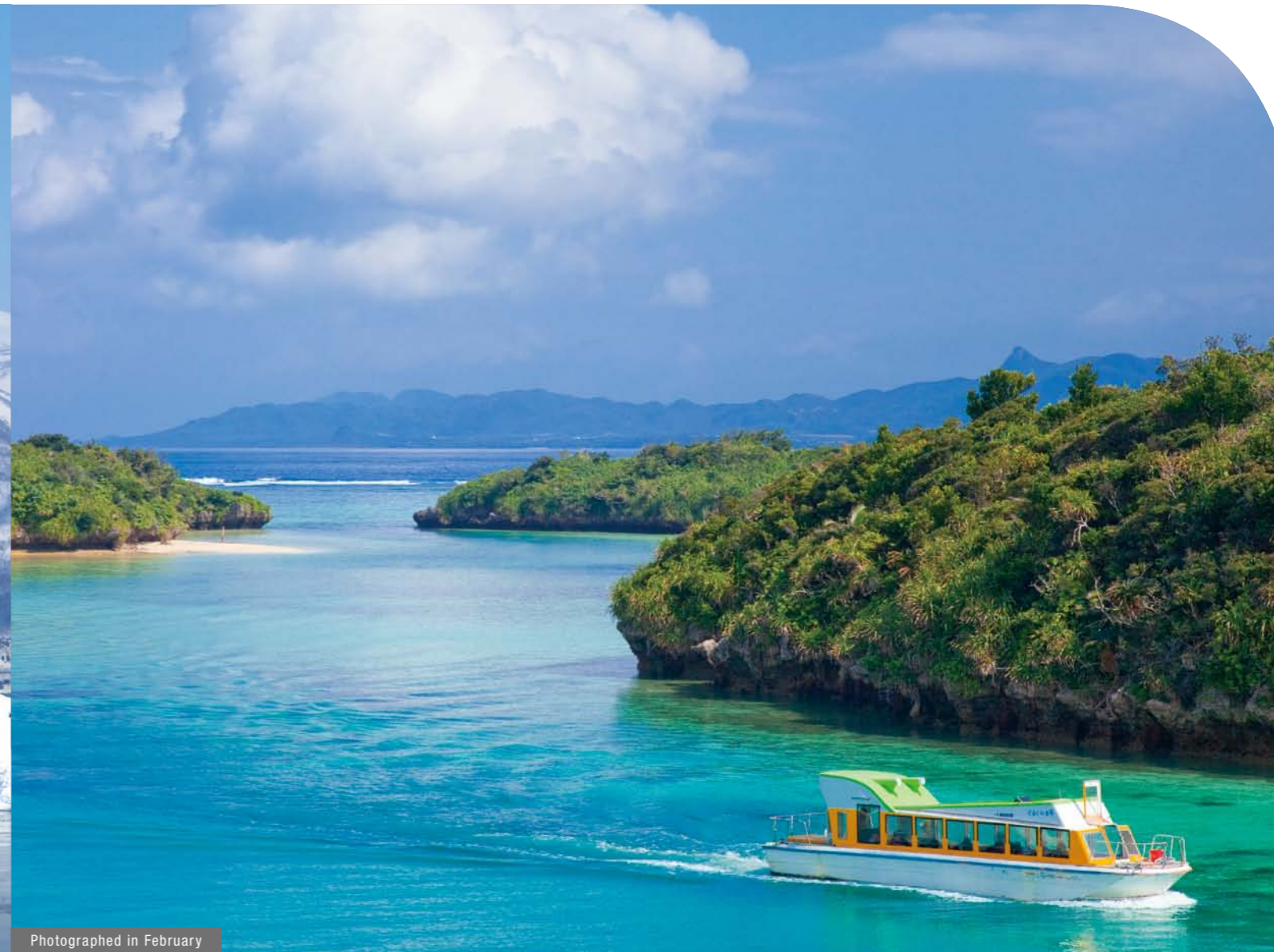
Photographed in February