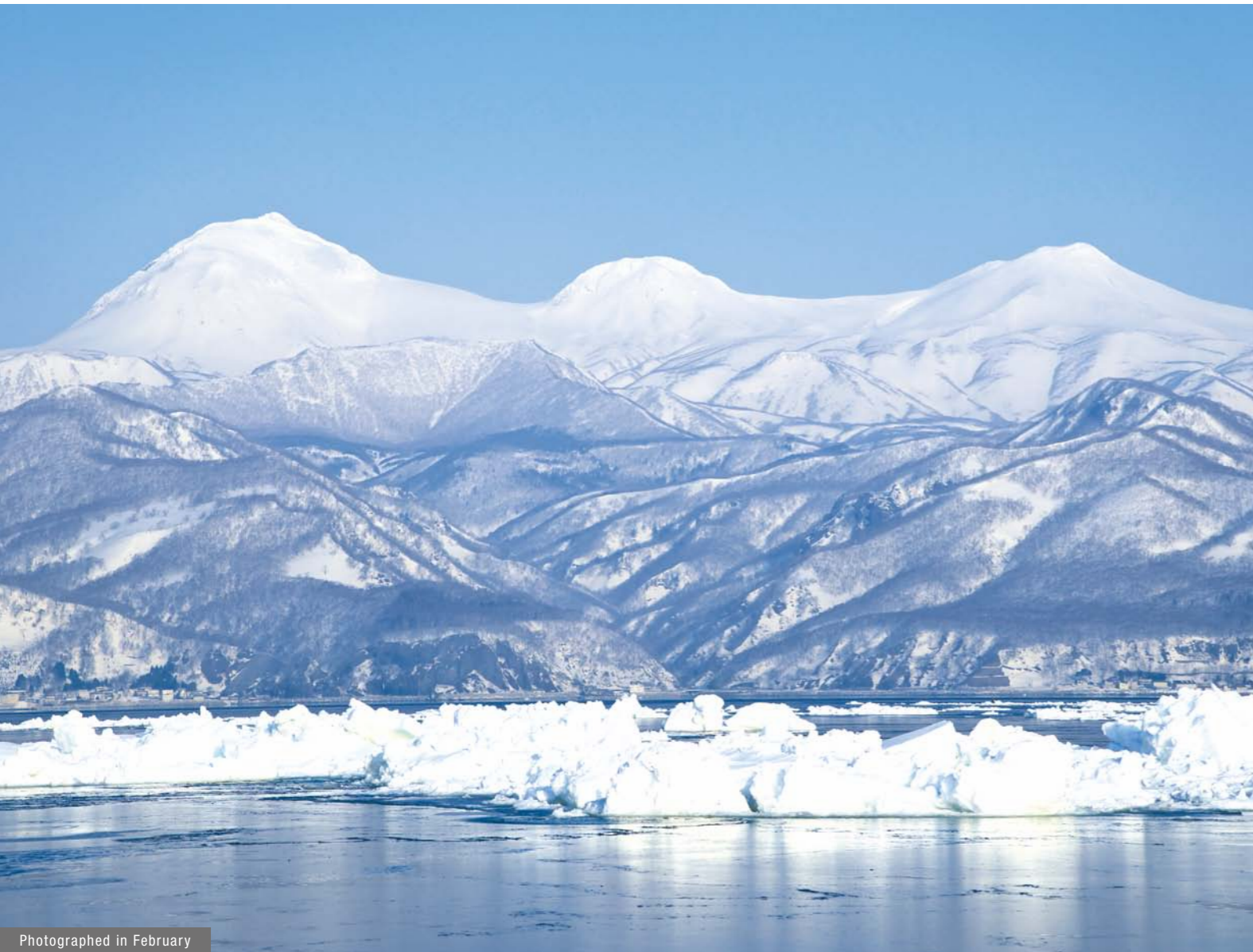
Photographed in February

► For more information, please visit: http://www.yaeyama.or.jp.e.kg.hp.transer.com/