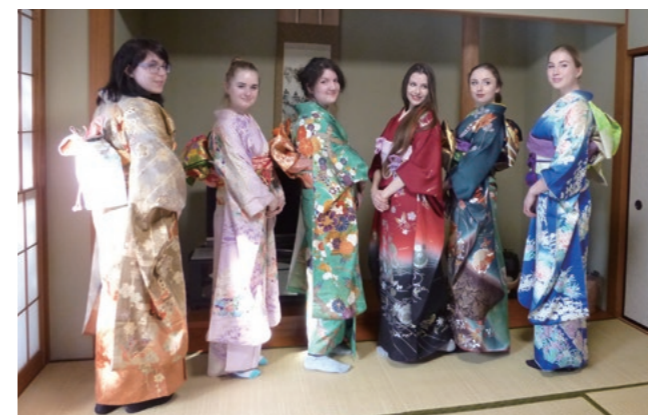
Russian students visited Japan through the cultural exchange program of Kanazawa University.