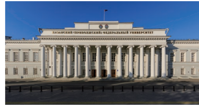
Kazan Federal University (left) in Kazan, capital of the Republic of Tatarstan, established in 1804, is known as the birthplace of organic chemistry in Russia. Kanazawa University (right) in Ishikawa Prefecture is a national university created in 1949 by the merger of five schools including the former national Kanazawa Medical University, which had its roots in a vaccination center established in 1862.