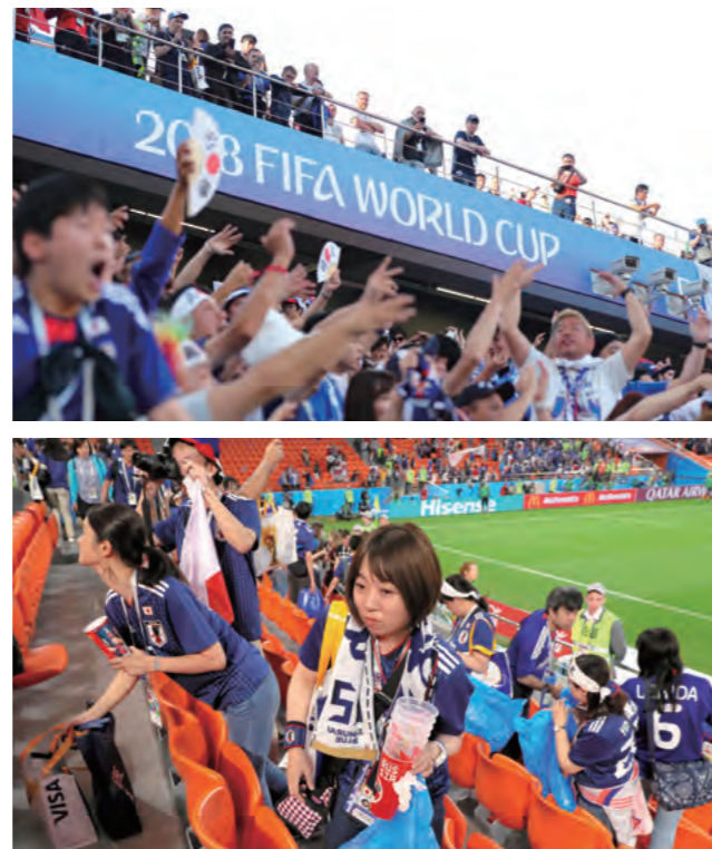
A number of Japanese football fans showed up to the 2018 FIFA World Cup Russia. They cleaned up stadiums after each of their matches. (June – July 2018)