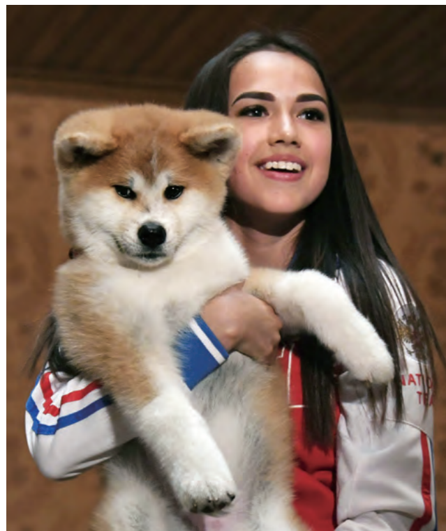
Alina Zagitova received an Akita dog in Moscow, while Prime Minister Abe visited the city to see President Putin. (May 2018)