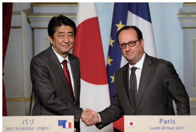
Shaking hands with President François Hollande of France during a visit to Paris (March 2017).