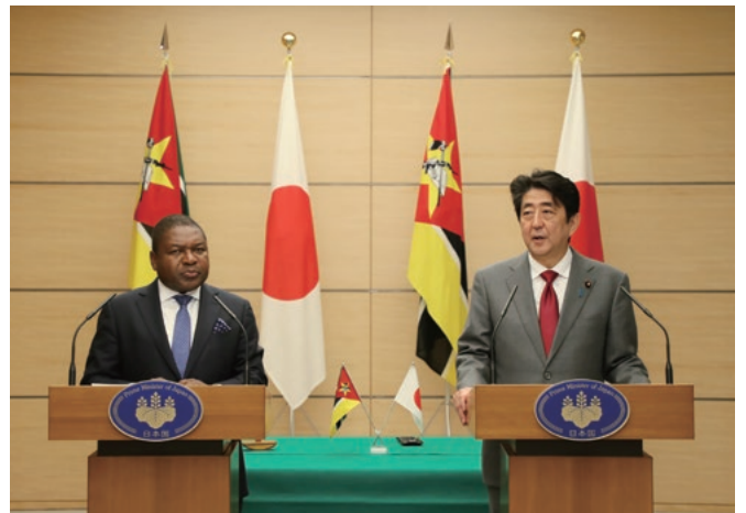
President Filipe Jacinto Nyusi of Mozambique came to the Prime Minister's Office, where Prime Minister Abe hosted a summit meeting and other events (March 2017).