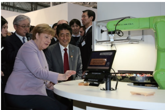
In Hannover, Germany, Prime Minister Abe and Chancellor Angela Merkel of Germany toured the exhibition venue of CeBIT 2017, an international trade fair for information and communication technologies (March 2017).