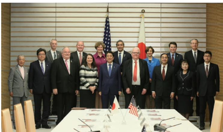
Prime Minister Abe with a delegation of the U.S. Congressional Study Group on Japan and a delegation of Japanese legislators participating in the U.S.-Japan Legislative Exchange Program, who came together for a courtesy call at the Prime Minister's Office (February 2017).