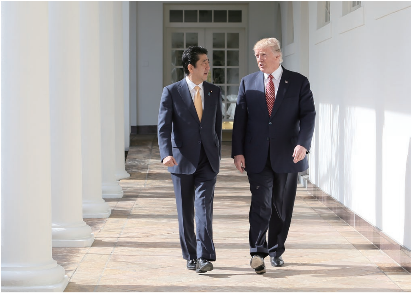
During a visit to Washington DC, Prime Minister Abe met at the White House with U.S. President Donald Trump (February 2017).