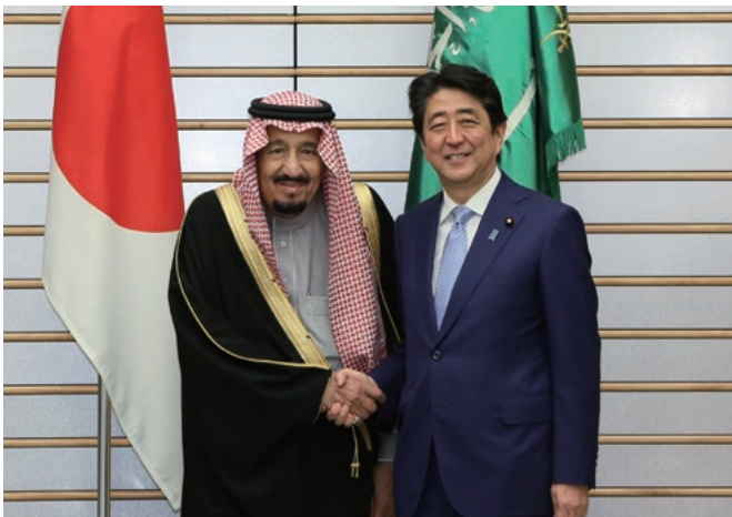
Prime Minister Abe hosted a summit meeting and other events with Custodian of the Two Holy Mosques King Salman bin Abdulaziz Al-Saud of Saudi Arabia at the Prime Minister's Office (March 2017).