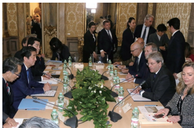
Prime Minister Abe visited Rome, where he held a meeting with Prime Minister Paolo Gentiloni of Italy (March 2017).