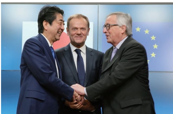
At a meeting in Brussels, Belgium, with European Council President Donald Tusk (center) and European Commission President Jean-Claude Juncker of the European Union (March 2017).