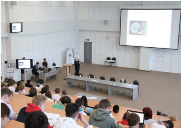
Hokuto and Russia's Far Eastern Federal University have entered a cooperation agreement for scientific study and research in the medical field. The medical interchange between the two institutions has been highly active, with activities and events that include an international conference featuring lectures and research presentations on medical care topics.