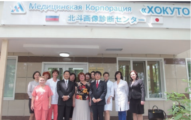
The Hokuto Diagnostic Imaging Center in Vladivostok. In just five months after its opening, the center had over 1,600 patients. This center is Japan and Russia's first jointly managed medical institution.