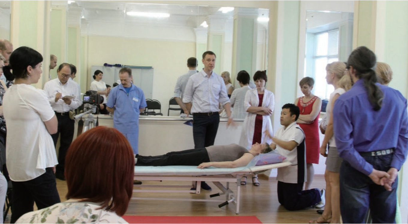
A presentation about Japanese-style rehabilitation. Scheduled to open in the near future, the rehabilitation center will be staffed by about five Russian individuals who will be guided by an expert physical therapist assigned from Japan.