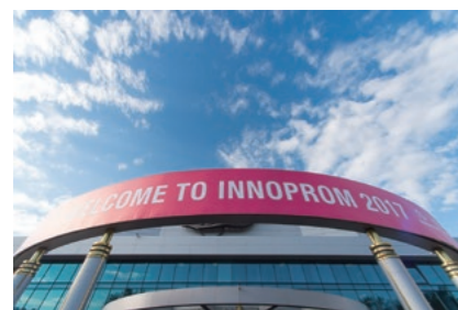
Russia's largest industrial trade fair, focused on subjects such as machinery, parts, IT, energy and urban development, is held every year in July. The number of visitors reached 50,194 over four days (based on the organizer's reporting number of visitor badges issued).

INNOPROM, one of Russia's largest industrial trade fairs, was held in Ekaterinburg from July 10 to 13. The event was a major success, with over 600 companies from 20 different countries exhibiting. Japan served as the partner country for INNOPROM 2017, working together with Russia to bring the event to a new level. President Putin, expressed his gratitude for Japan's partner-country role at a joint press conference with Prime Minister Abe during his visit to Japan in December 2016. To meet the high expectations, Japanese government and business worked together for preparing for