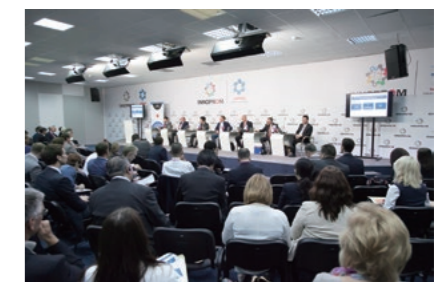
Various panels were held. One of them explored possibilities for cooperation between Japanese and Russian small businesses.