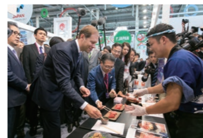
Minister of Industry and Trade Denis Manturov visited the Japanese food promotion booth and tried sashimi.