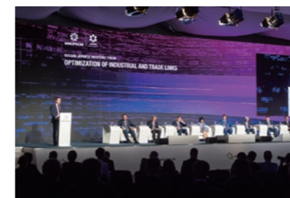
Leaders of Japanese and Russian industries discussed the present state and future development of economic cooperation between the two countries at the Japan-Russia Industrial Forum.

the exhibition. About 170 Japanese businesses and organizations participated in the "Japan Pavilion," the second largest number of participants following the host country's. In addition, the Japan-Russia Industrial Forum was held under the theme of "Japanese-Russian Cooperation for Industrial Optimization," in which leaders of Japanese and Russian industries emphasized the importance of collaboration. Many Japanese and Russian industry executives also joined panels on topics such as small businesses and productivity growth, where they enjoyed a lively exchange of opinions and ideas.