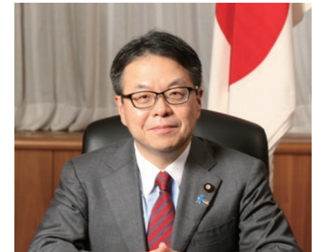
Hiroshige Seko, Minister of Economy, Trade and Industry and Minister for Economic Cooperation with Russia

Thus, economic relations between Japan and Russia are being profoundly strengthened by these developments taking place under the firm and like-minded trust between Prime Minister Abe and President Putin. As the minister in charge, I commit to devoting myself to the advancement of true partnership between our two nations, by continuing to create virtuous cycles in economy and politics through the realization of the cooperation plan.