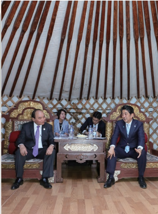
6. With Prime Minister Sheikh Hasina of Bangladesh. 7. With Prime Minister Nguyen Xuan Phuc of Viet Nam. 8. Summit meeting with Premier Li Keqiang of China. 9. With Prime Minister Hun Sen of Cambodia. 10. Leaders observing a moment of silence for the victims of the incident in Nice, France. 11. With Chancellor Angela Merkel of Germany.