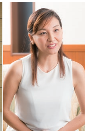
5 | 6