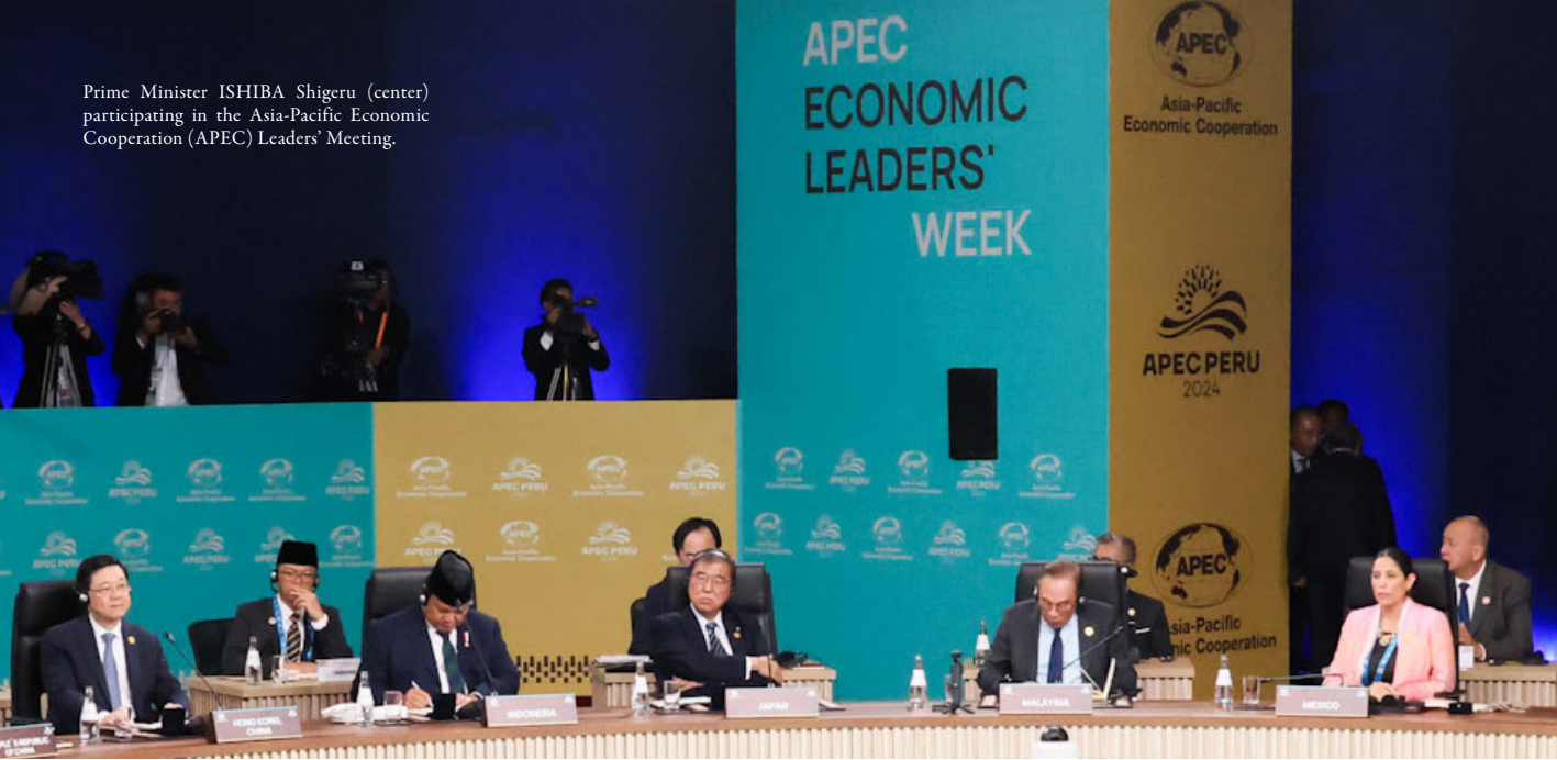
Prime Minister ISHIBA Shigeru (center) participating in the Asia-Pacific Economic Cooperation (APEC) Leaders' Meeting.