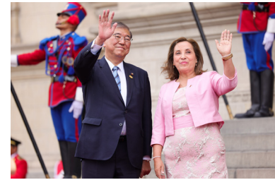
Prime Minister Ishiba made an official visit to Peru and held a meeting with President Dina Boluarte of the Republic of Peru.

On November 15 and 16, 2024, Prime Minister ISHIBA Shigeru attended the Asia-Pacific Economic Cooperation (APEC) Leaders' Meeting in Lima, the capital of the Republic of Peru, and reaffirmed Japan's commitment to sustainable growth and prosperity in the Asia-Pacific region. Additionally, he engaged in a trilateral summit with the presidents of the U.S. and the Republic of Korea (ROK) and held bilateral meetings with various countries, including China and Peru.