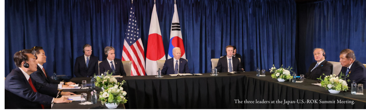
The three leaders at the Japan-U.S.-ROK Summit Meeting.

Thirdly, from the viewpoint of promoting women's economic empowerment and capacity building,