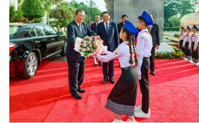
At the welcome ceremony in Lao PDR on October 11.

During the series of meetings, frank discussions were held on the international situation. The consistent message delivered by Prime Minister