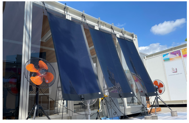
PSCs produced by SEKISUI CHEMICAL, which were also exhibited at the International Media Center (IMC) at the G7 Hiroshima Summit. SEKISUI CHEMICAL

affairs, energy security has become an urgent issue for every country. It will become increasingly important to introduce renewable energy sources that do not require fuel, and to diversify energy sources. Japan's efforts to harness the potential of solar power, a well-known renewable energy source, will shine a light on humanity's future.