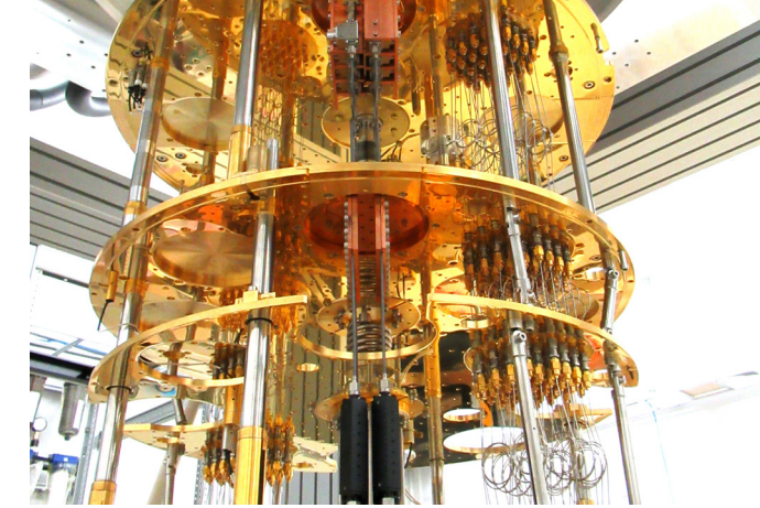
The inside of the superconducting quantum computer. Superconducting qubits only function in a state of superconductivity, in which electrical resistance disappears. They are stored in a cooling device that produces the superconducting state and reduces errors by lowering the temperature to near absolute zero ( -273.15^{\circ}C + 0.01^{\circ}C ).

However, human society is still at the dawn of the quantum computing era. Current quantum computers are limited in what they can do as they cannot churn out accurate calculations, owing to the fact that they produce errors after a certain amount of computation. The eventual goal is a fault-tolerant quantum computer that reduces errors during the computing process, while correcting any new ones that do arise. With researchers across the globe facing an enormous number of challenges, Japan's goal is to produce such a device by 2050.