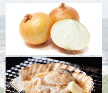
Kitami produces more onions and scallops than any other place in Japan. The city is famous not only for its fresh seafood but for its grilled meat (yakiniku) as well, making it a great place to enjoy food.

Kitami is surrounded by places of great natural beauty, including the World Natural Heritage Site of Shiretoko, and it is also the perfect place to both work and enjoy your days of leisure. Added to this is the bonus of the area's wide array of fresh seafood. Once the pandemic is over, what could be a more wonderful idea than visiting—and perhaps working in—this charming city and meeting its people.