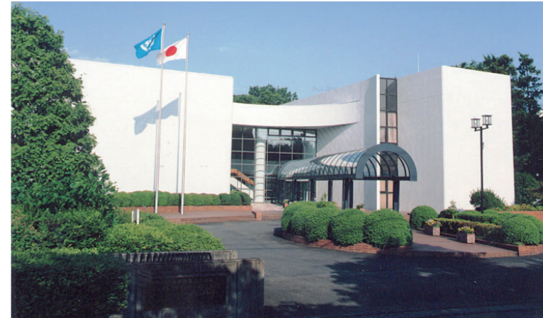
UNAFEI in Fuchu, Tokyo

UNAFEI official website http://www.unafei.or.jp/english/index.htm