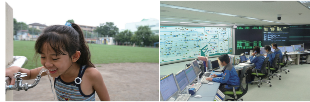
1. Safe and delicious water always available from Tokyo taps 2. Twenty-four-hour monitoring at the Water Supply Operation Center

● The Tokyo Waterworks Science Museum: http://www.waterworks.metro.tokyo.jp/eng/science/index.html