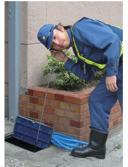
3. The advanced water purification process 4. Listening for leaks with a sound detection bar