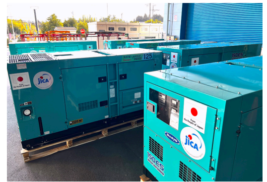
Above: Ukraine continues to experience massive power shortages due to Russian attacks on its power plants. The Government of Japan has provided generators to the country through Japan International Cooperation Agency (JICA) and United Nations High Commissioner for Refugees to help Ukrainians in the bitter cold, and has provided transformer equipment to restore power lines. JICA