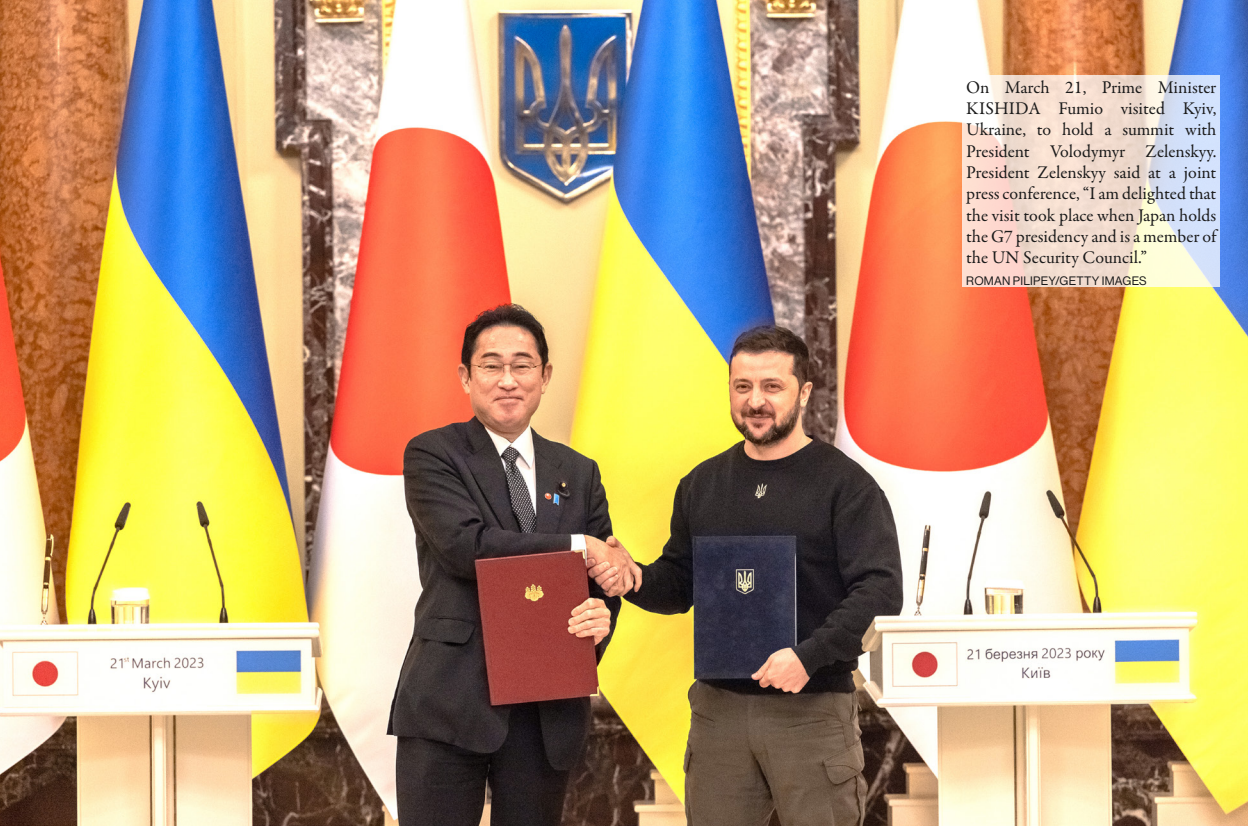
On March 21, Prime Minister KISHIDA Fumio visited Kyiv, Ukraine, to hold a summit with President Volodymyr Zelenskyy. President Zelenskyy said at a joint press conference, "I am delighted that the visit took place when Japan holds the G7 presidency and is a member of the UN Security Council."