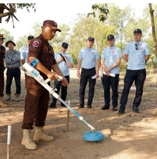
Right: Cambodian personnel demonstrate how to use Japan's latest mine detectors during a training session for mine-clearing experts from the Ukrainian government in anticipation of the country's recovery and reconstruction. Japan has cooperated with Cambodia in eradicating landmines for more than 20 years since the end of that country's civil war.

Ukrainian evacuees who have no relatives to rely upon in the country. Also, Prime Minister Kishida, during a stop in Poland after his visit to Ukraine, announced that Japan would provide ODA directly to Poland, which has become a frontline base for humanitarian aid to Ukraine, as a way to support the increasing burden and vulnerability of its neighboring countries.