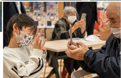
Bandai Town is working on digital transformation such as issuing a digital currency using blockchain technology. It also holds smartphone classes for seniors so that everyone can enjoy the digital life.