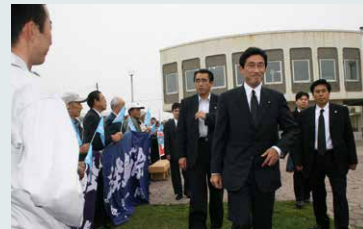
Kishida favors a hands-on approach and has visited many places throughout the country.

Kishida joined the Cabinet for the first time as a Minister of State for Special Missions, a position in which he took on assignments in various fields including Okinawa and Northern Territories Affairs, Quality-of-Life Policy, and Science and Technology Policy. He became Minister for Consumer Affairs in 2008, a position from which he worked for the establishment of the Consumer Affairs Agency.