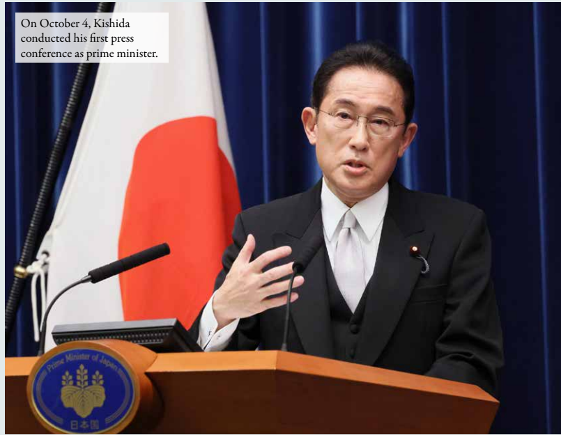
On October 4, Kishida conducted his first press conference as prime minister.