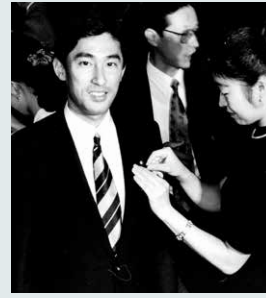
Kishida receives his parliamentary badge after being elected to the House of Representatives for the first time.

Helping his father's campaign and working for a bank awakened in Kishida an urge to serve the people directly by protecting their lives and improving society as a whole. That set him on his way to politics. In 1993, after his father's death, he ran for his father's seat in a district in Hiroshima and won his first political battle. He valued political stumping as a way to speak directly to voters—an approach that broadened his appeal and led to his winning the seat 10 times.