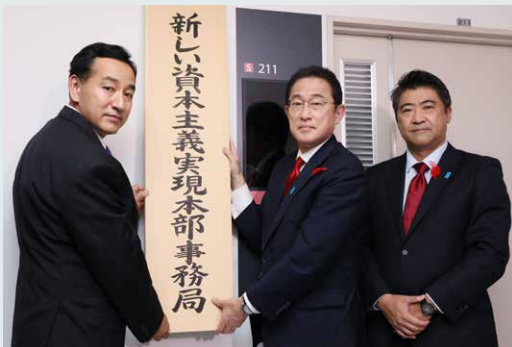
Prime Minister Kishida established a Council of the New Form of Capitalism Realization to discuss concrete measures to realize a new form of capitalism.

Due to the COVID-19 pandemic, people's mindset about their work style and lifestyle has changed, with digital transformation—which