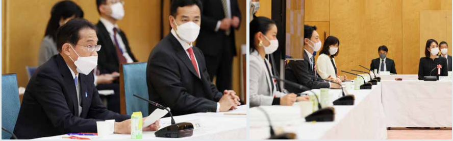
The emergency proposal was formulated at the meeting held on November 8.

until now had not proceeded very far—suddenly beginning to make rapid progress. Now is the time to reform conventional socioeconomic practices and restrictions as well as institutions to build a new society premised on coexisting with COVID-19.