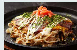
His favorite food is Hiroshima-style okonomiyaki (Japanese savory pancake). He ate the dish on the day that he was elected to head the Liberal Democratic Party. "I'll never forget how wonderful it tasted," he says.