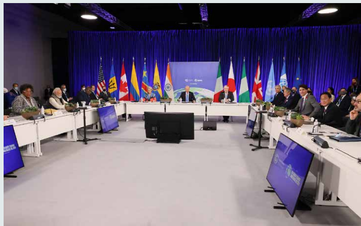
Top: At a high-level event on infrastructure and climate change, Prime Minister Kishida said that he would lead the international community’s commitment to achieving a better recovery from COVID-19.

With an aim to realizing a future where vehicles, the world’s essentials, will become zero emission, Japan will take advantage of all the available options of technologies.