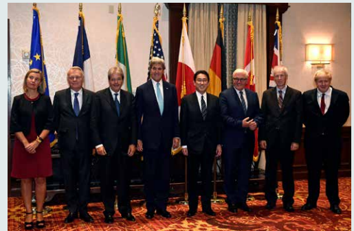
Top: Kishida visited New York in 2016 to attend a G7 Foreign Ministers' Meeting as the chair.