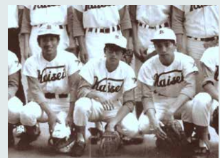
Kishida (center) played second base for his high school team.

After returning to Japan, Kishida attended public elementary and middle schools before going on to Kaisei Senior High School, a prestigious private academy. He was an enthusiastic member of the baseball team, an experience that taught him the importance of working together as a team. In 1978, he entered the School of Law at Waseda University. When his father ran for the House of Representatives for the first time the following year, Kishida helped him to campaign.