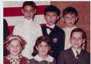
Kishida (top row, second from right) with classmates in Queens, New York.

When his father was assigned to work in the United States, the family moved to New York. Kishida attended a local public elementary school from the first to third grades, where he was impressed by the liberal ambience of the U.S. and learned to respect diversity.