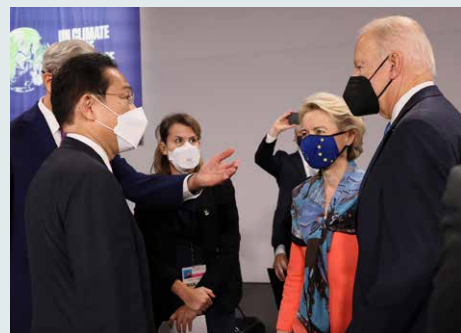
Right: In between the meetings, the prime minister actively engaged in summit diplomacy including talks with President Joe Biden of the United States.

By utilizing our own 2 trillion yen Green Innovation Fund, Japan will develop next-generation batteries and motors, hydrogen, and synthetic fuels, which all hold the key to the spread of electric vehicles.