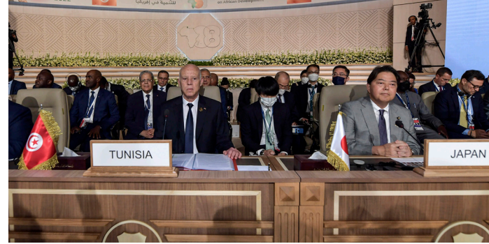
This is the second time Africa has hosted TICAD, the previous instance being the Kenya meeting in 2016.

At the conference, Prime Minister Kishida shared his hopes of realizing a resilient Africa that the continent itself aims to achieve, with a specific focus on “investment in people” and “quality of growth.” He announced that Japan will invest 30 billion dollars as the sum of its public and private financial