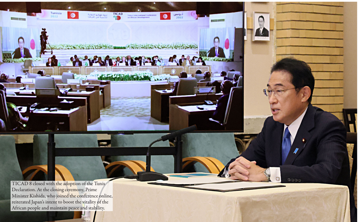
TICAD 8 closed with the adoption of the Tunis Declaration. At the closing ceremony, Prime Minister Kishida, who joined the conference online, reiterated Japan’s intent to boost the vitality of the African people and maintain peace and stability.

Africa, which is expected to account for a quarter of the world’s population by 2050, is surely a treasure chest of possibilities. Based on the discussions at this year’s TICAD, Japan will strongly support development in Africa on the basis of African ownership.