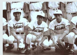
Kishida (center) played second base for his high school team.

After returning to Japan, Kishida attended public elementary and middle schools before going on to Kaisei Senior High School, a prestigious private academy. He was an enthusiastic member of the baseball team, an experience that taught him the importance of working together as a team. In 1978, he entered the School of Law at Waseda University. When his father ran for the House of Representatives for the first time the following year, Kishida helped him to campaign.