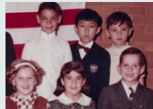
Kishida (top row, second from right) with classmates in Queens, New York.

When his father was assigned to work in the United States, the family moved to New York. Kishida attended a local public elementary school from the first to third grades, where he was impressed by the liberal ambience of the U.S. and learned to respect diversity.