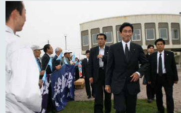
Kishida favors a hands-on approach and has visited many places throughout the country.

Kishida joined the Cabinet for the first time as a Minister of State for Special Missions, a position in which he took on assignments in various fields including Okinawa and Northern Territories Affairs, Quality-of-Life Policy, and Science and Technology Policy. He became Minister for Consumer Affairs in 2008, a position from which he worked for the establishment of the Consumer Affairs Agency.