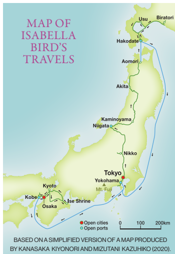
At the time, a special permit was required for foreigners to travel in the "interior," the area beyond the 40 km radius of the two open cities and the five open ports (the four shown on the map plus Nagasaki).

When she first visited Japan in 1878, Bird had already been celebrated for her travelogue of the Hawaiian Islands. By applying all her prior experience and her keen sense of duty, she successfully completed the arduous journey at a time when movement around Japan by foreign visitors was heavily restricted (Photo taken in 1881). KANASAKA KIYONORI