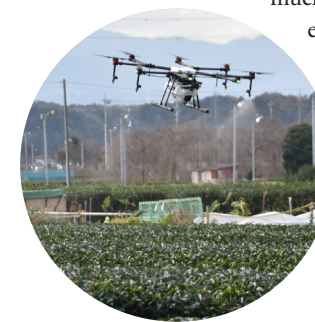
By putting into practice innovations that reduce the environmental impact of agriculture, Japan will create a leading model for sustainable food systems in the Asian monsoon region.