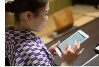
The Jinya's in-house system is built on the inn's hospitality management expertise. As other inns across Japan adopt this system and offer their feedback, it has been further evolving.