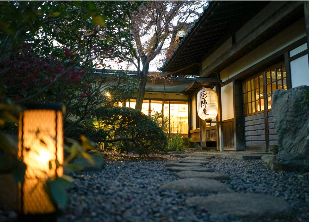
Jinya, where guests clearly sense Japan's history and traditions, has a Japanese garden covering some 33,000 m 2 , offering abundant natural surroundings that change with each season.