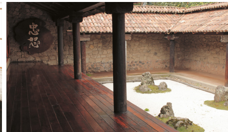
Right: The inclusion of a rock garden enhances the Japanese ambience.