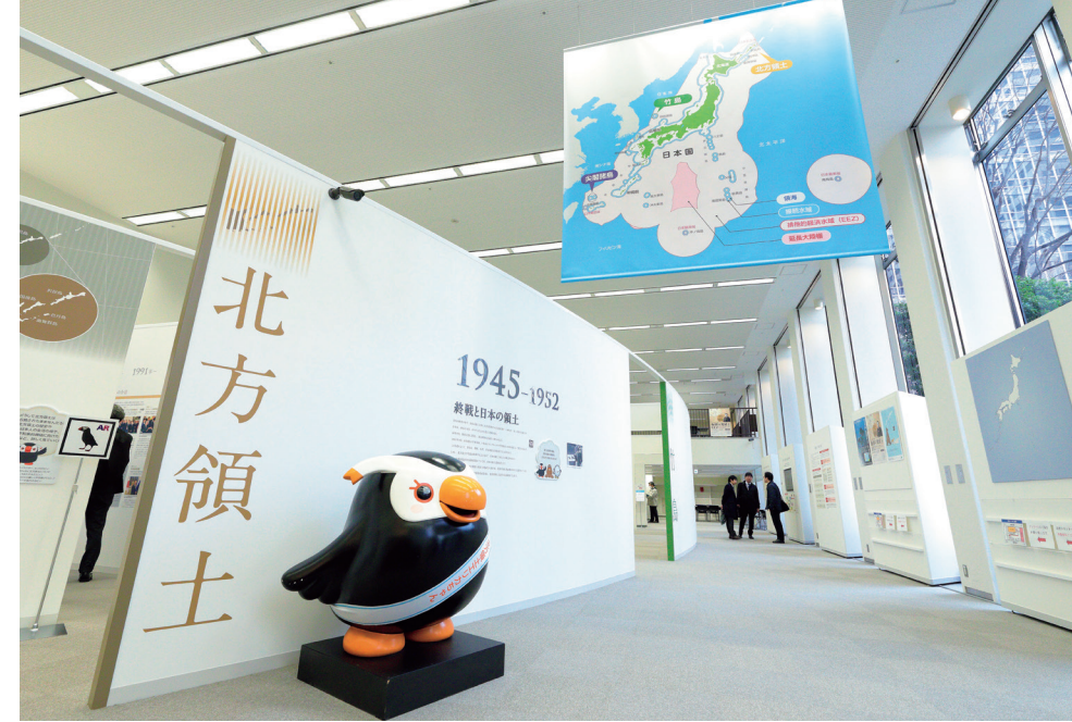
Visitors are welcomed by Erica-chan, the mascot for the Northern Territories. Admission is free. Located at 3-8-1 Kasumigaseki, Chiyoda-ku, Tokyo.

The Northern Territories section has panels to introduce the history of territorial determination between Japan and Russia and the details of the negotiations between the two countries, including those held during the Soviet era. The projection mapping, which projects images onto a three-dimensional map, visualizes the process of the 1945 Soviet Union invasion and occupation of the Northern Territories. At the same time, daily commodities used by residents of the Four Northern Islands during the prewar period are exhibited, showing how the actual life of the islanders was.