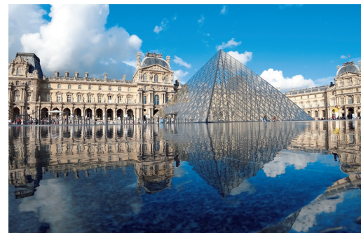
Photocatalysis acts as an antifouling and antifogging effect simply by the irradiation of light. It has also been used in the glass covering the pyramid-shaped entrance of the Louvre Museum. The glass maintains its transparent beauty by decomposing dirt.