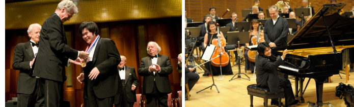
Left: When Tsujii triumphed at the Van Cliburn International Piano Competition in 2009, he received the gold medal from Cliburn himself (left front). The encounter is one of his most treasured memories.

Born in Tokyo in 1988, Tsujii showed great promise at the piano from an early age despite his disability, and decided at age 10 that he wanted to play professionally. In 2005, he became the youngest person to compete in the International Chopin Piano Competition, where he was granted the critics' award. Since winning the top prize at the Van Cliburn International Piano Competition in 2009, he has performed on stages the world over.