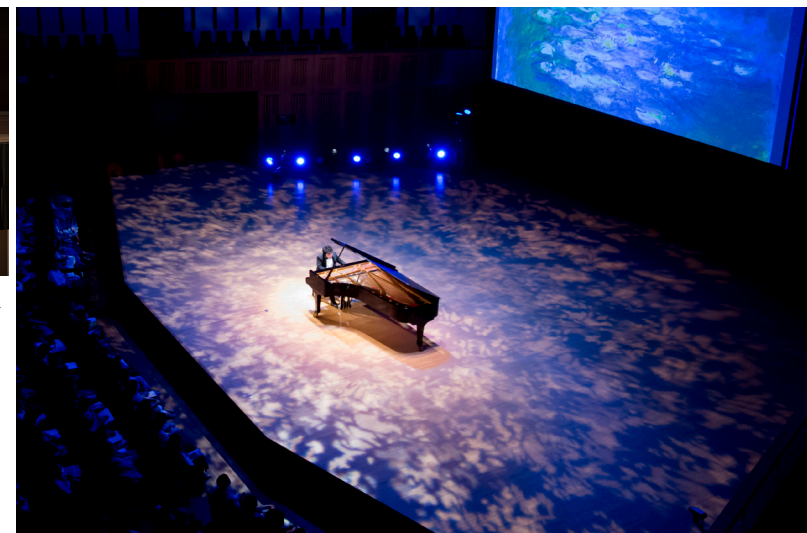
Right: Since 2016, Tsujii has been regularly holding concerts where audiences can enjoy a fine selection of impressionist, ukiyo-e, and other art projected onto giant screens during the performance.