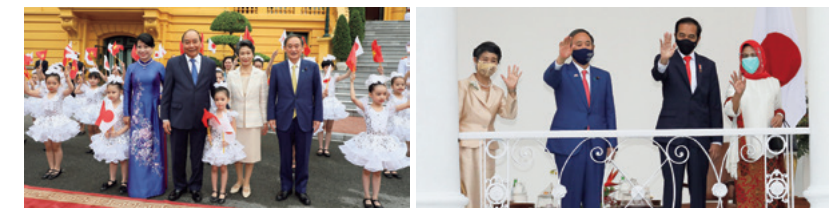
Prime Minister Suga visited Viet Nam and Indonesia on his first overseas visit. Japan concurred with both countries to work together toward a free and open Indo-Pacific region for a peaceful and prosperous future of the region. Left: Met with H.E. Mr. NGUYEN Xuan Phuc, the Prime Minister of Viet Nam. Right: Met with H.E. Ir. H. Joko Widodo, the President of Indonesia.

A single country alone cannot deal with cross-border crimes at sea and maintaining worldwide maritime order is a difficult task. Through cooperation with other countries, Japan will continue to promote the vision of a free and open Indo-Pacific with the greatest priority on realizing the values of "free and open."