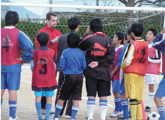
1. An ALT team-teaching in the classroom. 2. Saga Prefecture Charity Christmas Party 2012. 3. A CIR interpreting for a local authority representative and visitors from overseas. 4. Dressing up as models using newspaper at an orphanage. 5. A SEA teaching soccer during club activities.