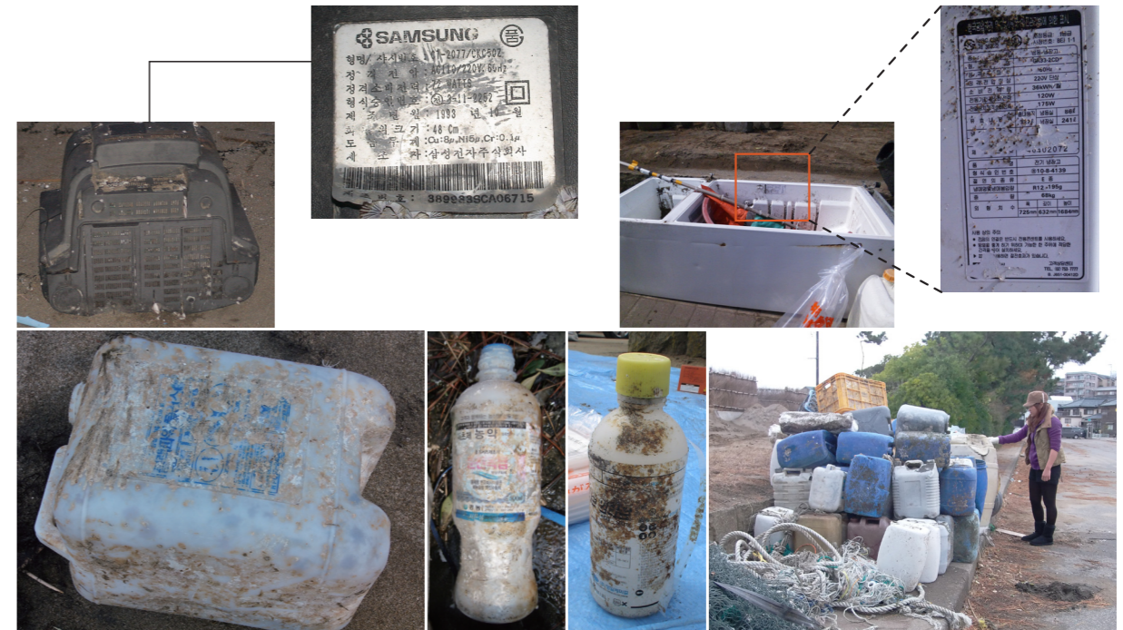
1. The Hokuriku region of Japan is facing the Sea of Japan. 2. People engage in cleanup activities undaunted by the vast amounts of trash that wash ashore.