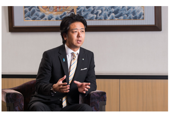
"By implementing deregulation measures, clearly defining employment terms, and making it easier to employ foreign workers, Fukuoka is striving to attract people and companies from around the world that want to start a new business; the city strives to continuously generate new value."—Fukuoka Mayor Snichiro Takashima

With office rents a third of those in Singapore or London, and half of those in Tokyo, Fukuoka's low office rents let businesses save on expenses. Fukuoka offers an ideal living environment for foreigners; including advice for international visitors and residents, multilingual maps, signs, and public facility information, and an outstanding educational environment, with Japanese classes for all ages and globally aware schools for young learners.