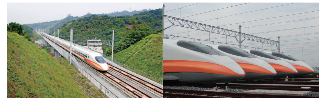
The Taiwan High Speed Rail line is one example of the export of Japanese Shinkansen technology.