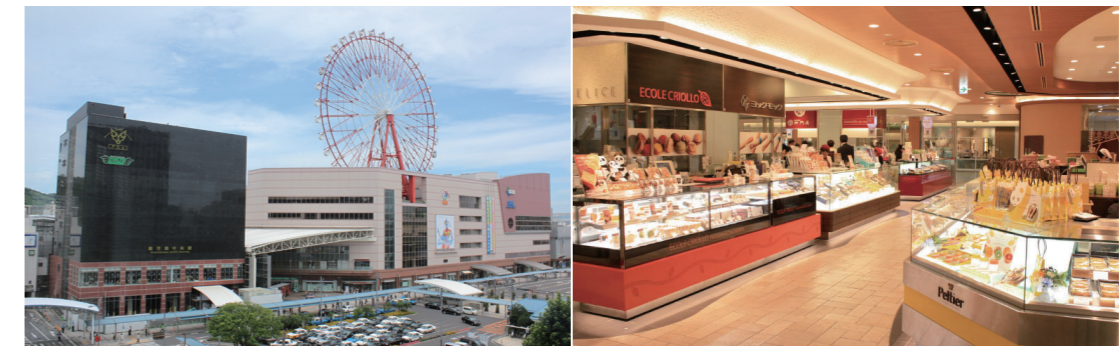
The launch of a Kyushu Shinkansen service to Kagoshima-Chuo Station greatly stimulated the regeneration of the surrounding area (left). The diverse range of shopping options available at in-station malls such as Ueno Ecute (right) almost makes you forget you have passed beyond the ticket barriers.